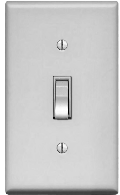
When you leave a room, remember to turn the lights off.

If the air conditioner is on, keep doors and windows closed. Don't go in and out, in and out. If you can, just use a fan and wear light clothes instead of using the air conditioner.