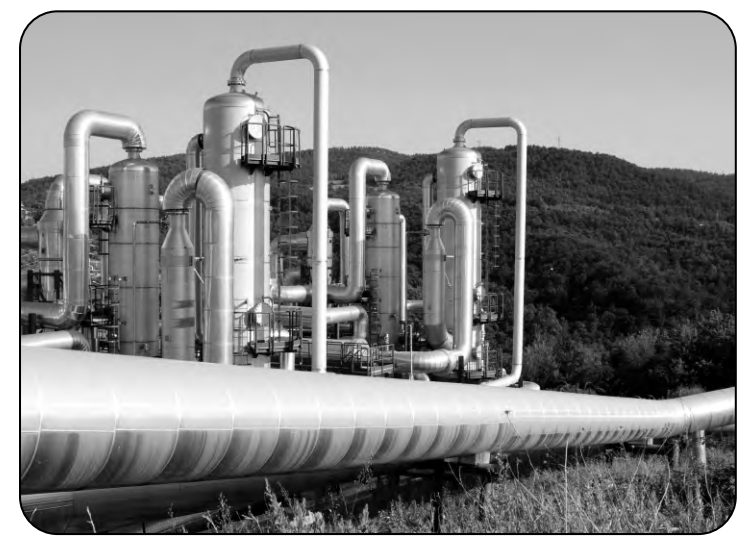
Natural gas is transported through pipelines.

Factories burn natural gas to make products like paper and cement. Natural gas is also an ingredient in paints, glues, fertilizers, plastics, medicines, and many other products. Industries like these use 32 percent of U.S. natural gas.