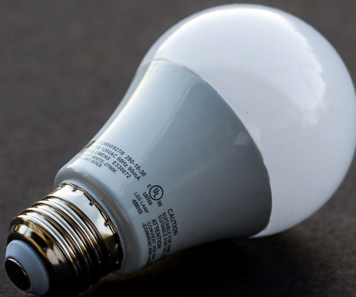
Light Emitting Diode (LED) Bulb