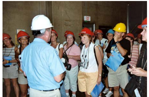
Las Vegas conference attendees experiencing a hard hat tour of Hoover Dam.

With the leadership of a dedicated team of NEED facilitators, the 2005 summer conference series was a great success. Educators attending represented over 25 states and three U.S. territories. These conferences are a great way to increase energy knowledge, prepare for implementing energy education programs in the classroom or begin development of a regional NEED program. Over 250 educators attended the conferences in Alexandria, VA; New Orleans, LA; and Las Vegas, NV. Many thanks to the companies, organizations, and government agencies that sponsored teachers to attend and hosted the field trips to BP Solar, the International Petroleum Exposition, and Hoover Dam. Sponsorship of 2006 conference attendees is $1,000 and includes lodging, meals, and all materials. The summer 2006 schedule will be finalized by the end of September. Watch NEED's website and newsletter for information.