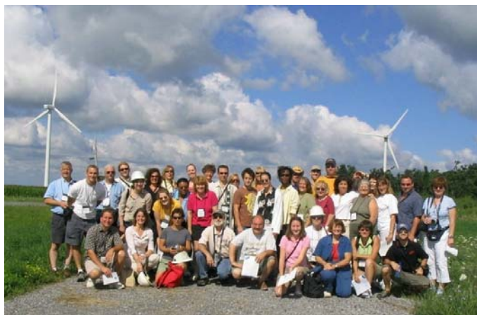
Participants of NYSERDA's Energy Leadership Training Conference in Syracuse, NY touring a wind farm.