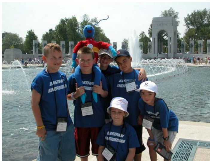
Energy Ant and the Eastham Energizers explore the WWII Memorial during Youth Awards in Washington, DC.

To see a slide show of the weekend's activities, or for more information about these national award winning projects, visit www.NEED.org .