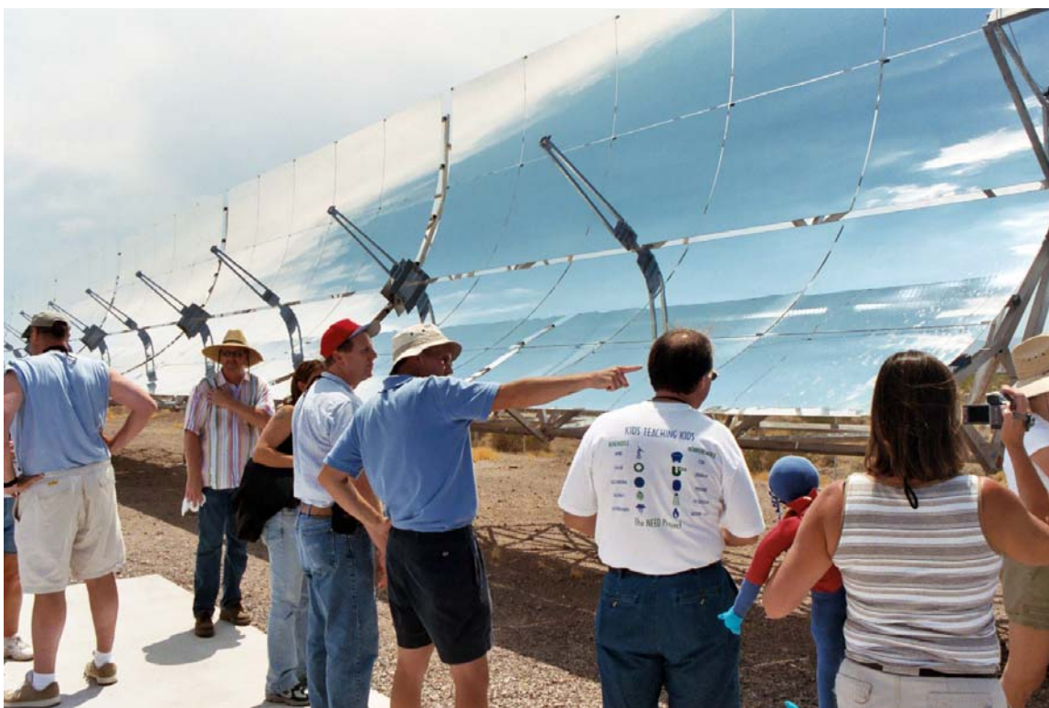
Educators attending NEED's National Energy Conference in Las Vegas, Nevada learned about solar collectors after a field trip to Hoover Dam. This advanced parabolic trough pilot project, located near Boulder City, Nevada, is managed by the UNLV Center for Energy Research.

For more information, visit www.konarka.com .