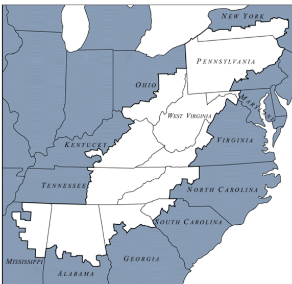
On the map above, the Appalachian Region is shown in white.

For more information, visit the Appalachian Regional Commission's website at www.arc.gov .