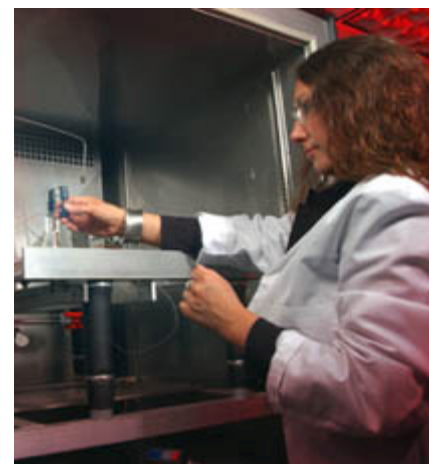
A NETL employee conducts research.

For more information, visit www.netl.doe.gov .