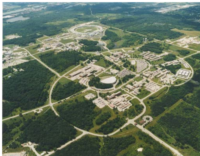
Argonne occupies 1,500 wooded acres in DuPage County, IL.

Argonne is a direct descendant of the University of Chicago's Metallurgical Laboratory, part of the World War II Manhattan Project. It was at the Met Lab where, on Dec. 2, 1942, Enrico Fermi created the world's first controlled nuclear chain reaction. After the war, Argonne was given the mission of developing nuclear reactors for peaceful purposes. Over the years, Argonne's research has expanded to include many other areas of science, engineering and technology.