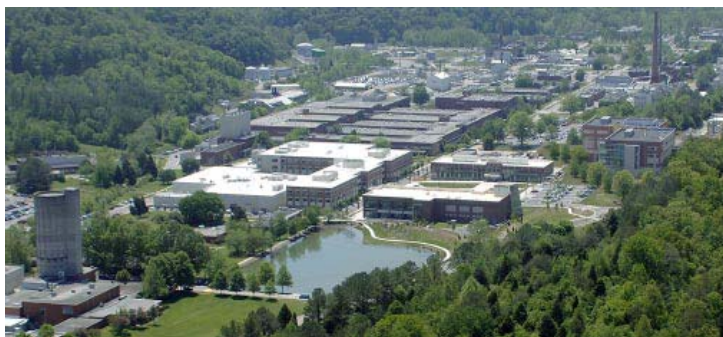
Above, the ORNL facility located in Oak Ridge, TN.

As an international leader in a variety of scientific areas that support the Department of Energy's mission, ORNL has six major mission roles: neutron science, energy, high-performance computing, systems biology, materials science at the nanoscale, and national security. ORNL's leadership role in the nation's energy future includes hosting the U.S. project office for the ITER international fusion experiment and the Office of Science-sponsored Bioenergy Science Center. Visit the Oak Ridge National Laboratory website at www.ornl.gov .