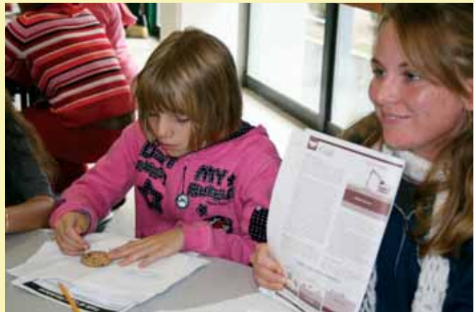
Above: A NEED-trained teacher reads a story from the NEED Infobook about the formation of coal and discusses coal mining with students at an energy carnival held at Mattacheese Middle School in Yarmouth, MA. A team of students "mine" chocolate chips from cookies to understand the mining process. The Cape Light Compact puts on programs like this one at schools throughout their area every year.