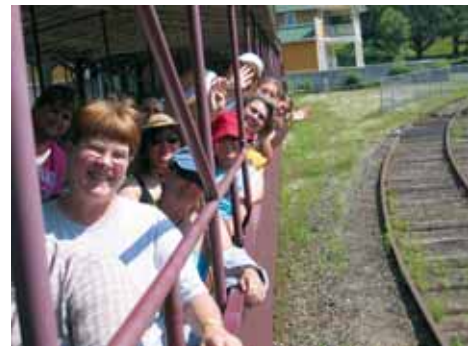
Participants in the Kentucky Energy Tour traveled by train to the historic Blue Heron coal camp, an oral history center where the people who actually lived and worked there tell their story through recordings housed in "ghost structures" – representations of where the actual buildings once stood many years ago.

Programs like a trip down into a coal mine and teams of administrators, teachers and facility personnel working together for energy management get NEED involved in activities impacting educators, students and their