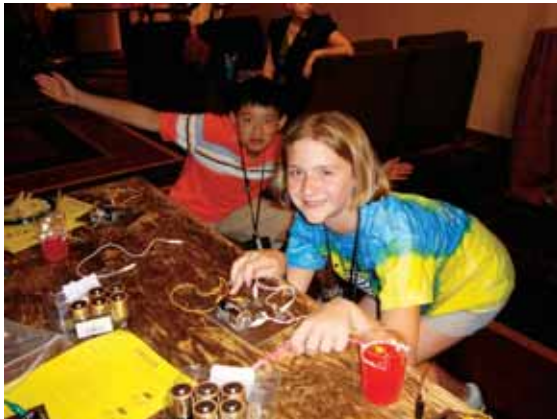
Students from Robert E. Lee Elementary School in Tennessee learned about circuits and electricity while using activities in NEED's Electroworks Curriculum.