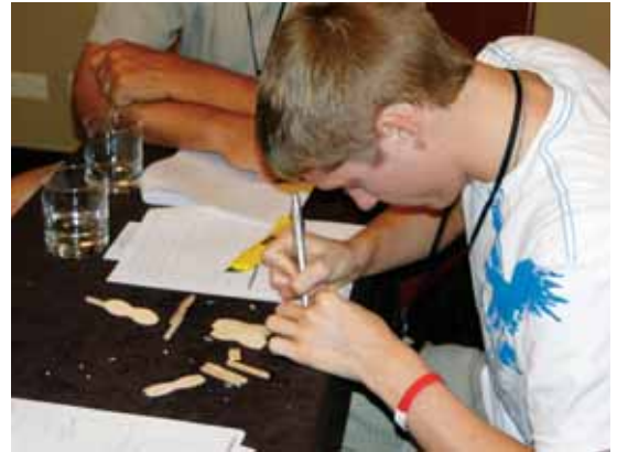
NEED secondary school students prepared hydropower activities to share with other students.