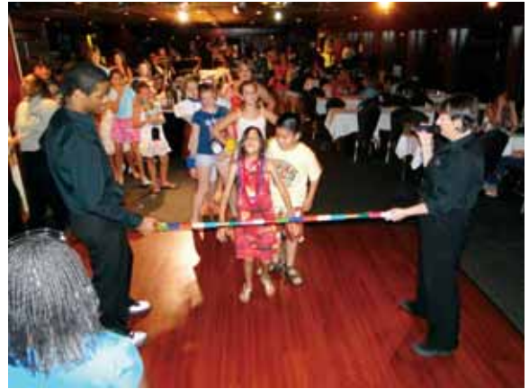
How low can you go? Students enjoyed the limbo contest during the evening cruise on the Potomac.