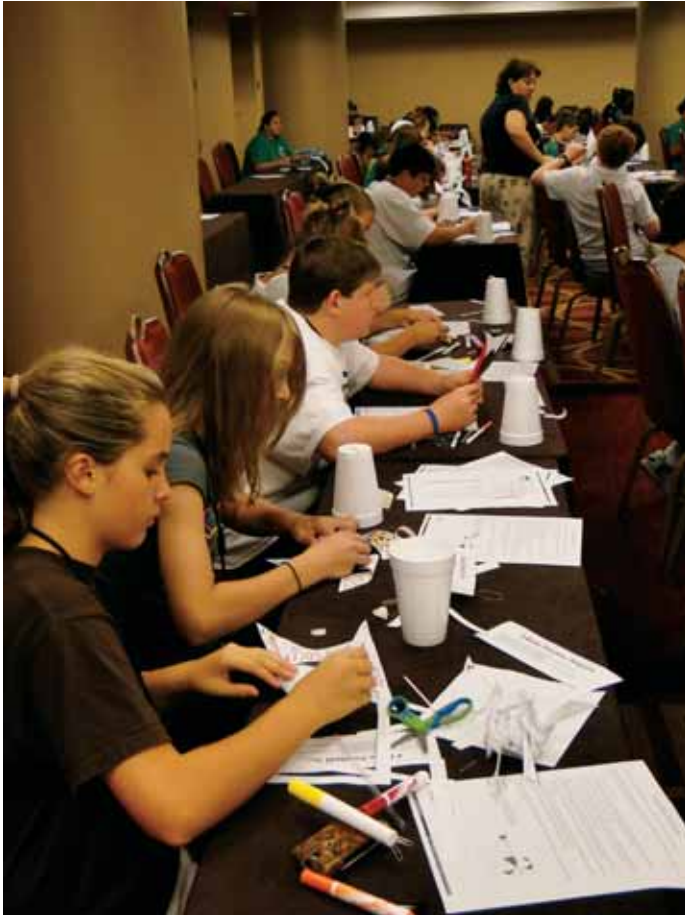
2009 Youth Awards attendees participated in wind activities.