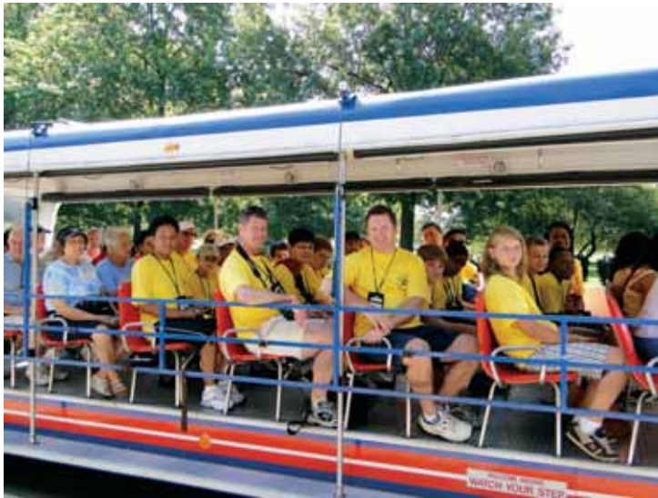
Teams spent a full day during the weekend activities riding D.C.'s Tourmobile to the city's sites. This group from Kankakee, Illinois, was just starting out from Arlington Cemetery for their visit to dozens of historic locations throughout the area.