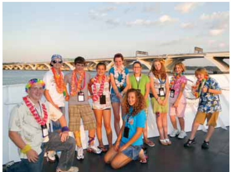
It's a whole different city when you see it from the water, and these students are certainly enjoying their cruise on the Potomac.