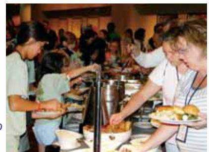
One thing about Youth Awards – you never go home hungry.