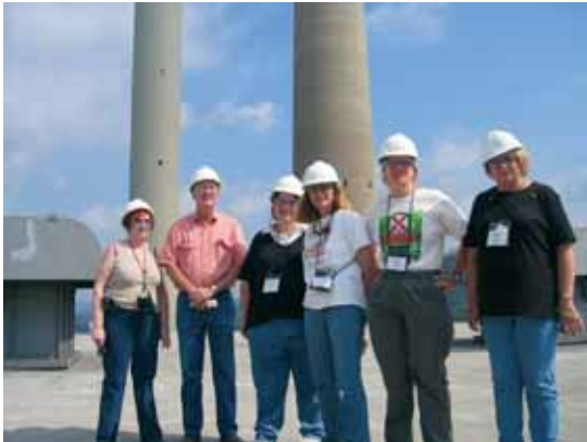
Kentucky teachers visited the Spurlock Fossil Plant in Maysville, KY, for the dedication of a new 268-megawatt unit using a cutting-edge clean coal technology known as circulating fluidized bed process, making it one of the cleanest coal-powered units in the nation.

Kentucky besides the tour, including a partnership with the Kentucky Department for Energy Development and Independence (KYDEDI) that provides $350 mini-grants to schools and other non-profit organizations to conduct Change the World, Start with ENERGY STAR projects in their