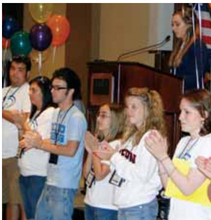
Thank you to all the student leaders who made the Youth Awards program go so smoothly.