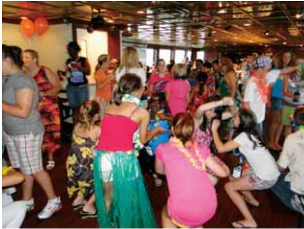
Dancing onboard the cruise ship was a popular activity for all ages. Somehow the DJ knew exactly the right songs to play!