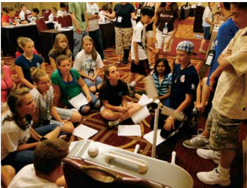
It really works! The final step in the wind power activities is to see if your turbine actually generates electricity. After all their work designing and building their wind turbines, these students are enjoying that first moment of seeing the blades spinning when the wind from the fan hits them.