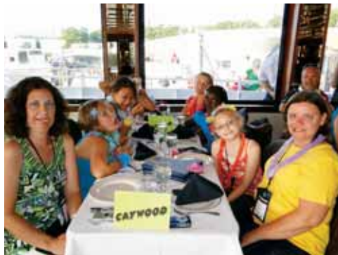
Making a funny face for the camera is always fun for teachers and parents as well as for students.