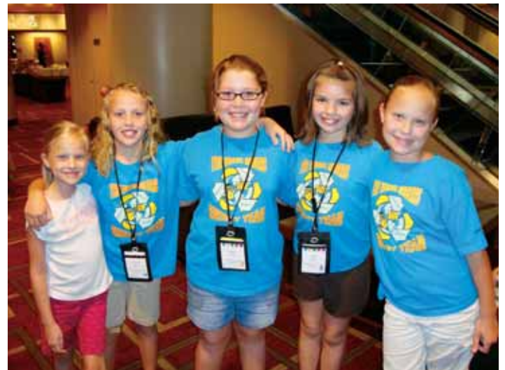
Members of the Wisser Miser Energy Team at Huntingdon Primary School in Tennessee – winner of this year's Primary Level School of the Year Award – enjoyed celebrating their achievement during the weekend activities.