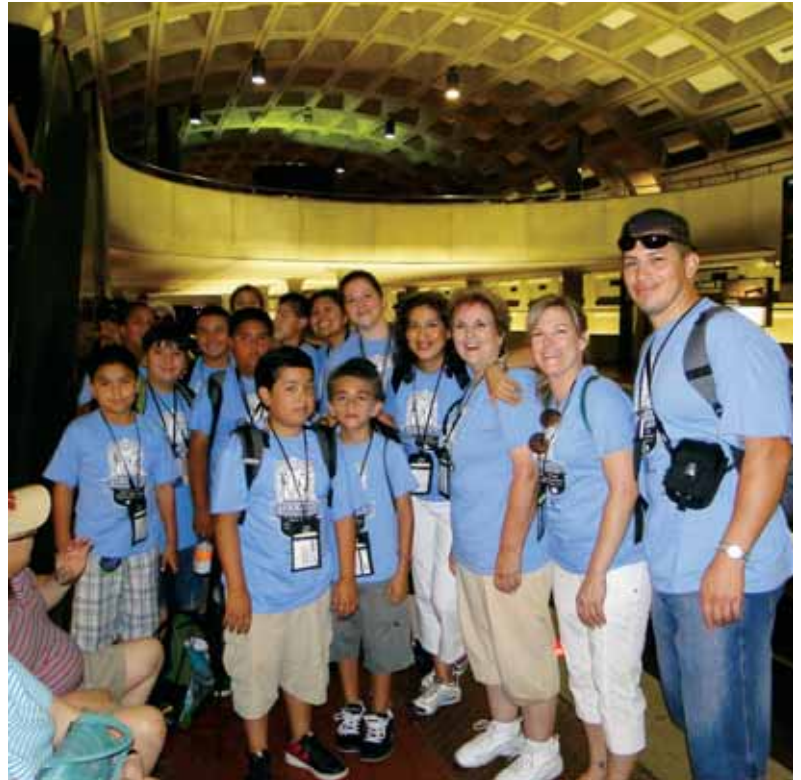
Students, family members and teachers from Urbita Elementary School in San Bernardino, CA, rode the subway to see the sites in D.C. At last report, none of them got lost.

The NEED Youth Awards are really all about the energy of kids!