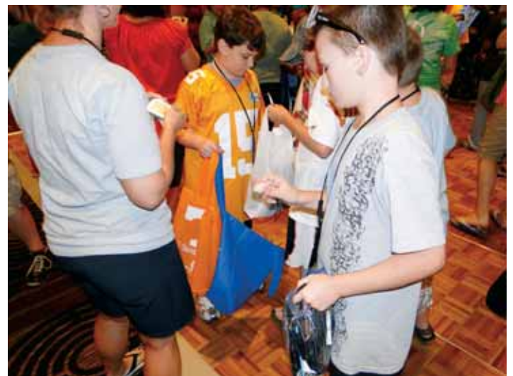
Youth Awards winners traded trinkets, Moon Pies, pins, coal and more at the Parade of States Dinner.