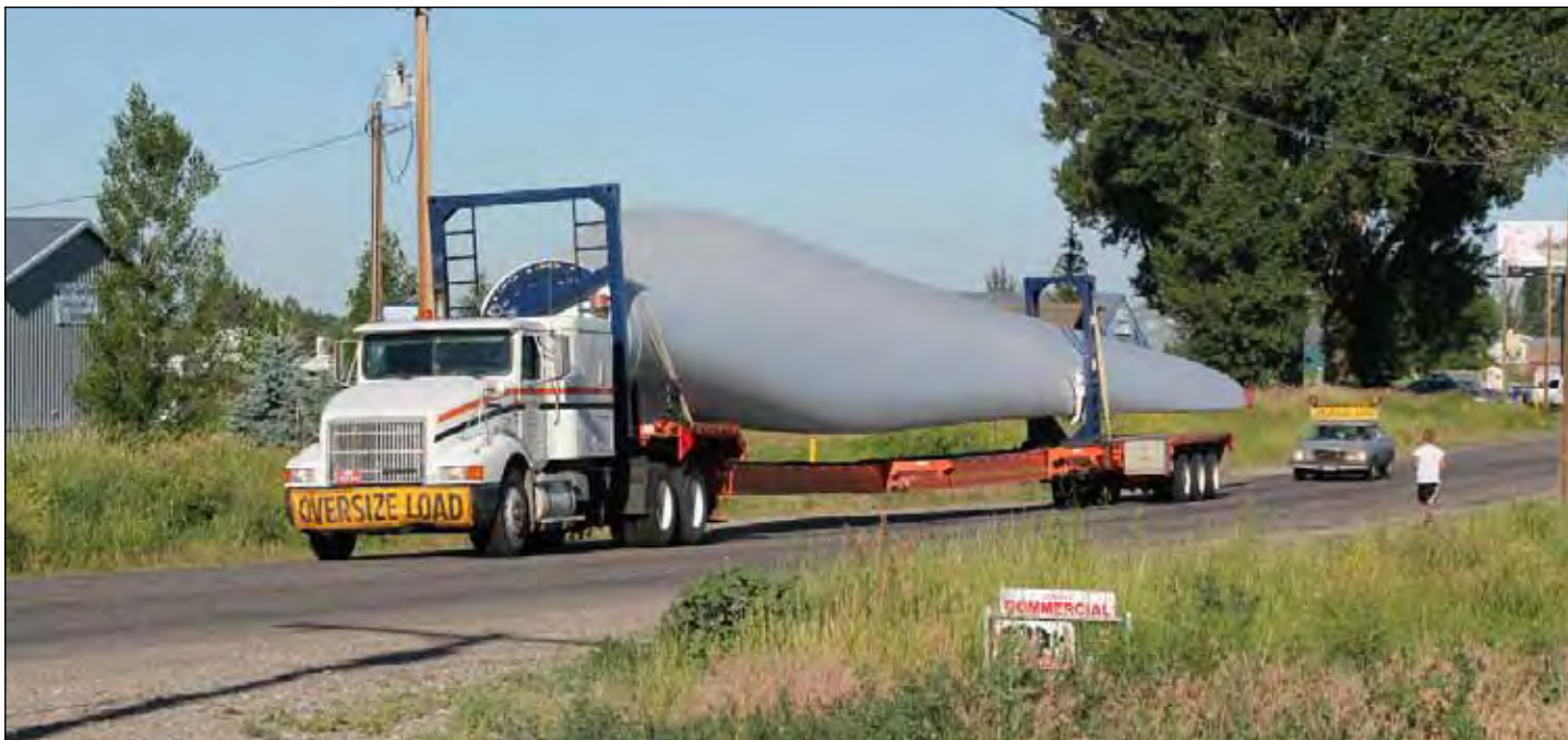
The growing wind energy industry has become a source for 'green' manufacturing jobs in the U.S. Five years ago, 75 percent of turbine parts were manufactured abroad, but today, more than 50 percent are produced domestically.