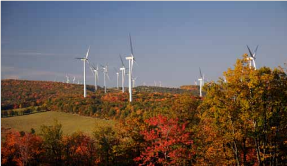
Shell's NedPower Mount Storm Wind Project, situated atop the Appalachian Mountains, in Grant County, West Virginia.

“There is room for all skills in the wind industry. We need people with skills in human resources, safety, communication, health, finance, environmental science, and biology.”